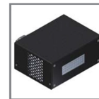
UV Curing System