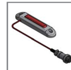
External Light Beacon